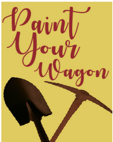
Paint Your Wagon Jan.18-Feb. 4 2018