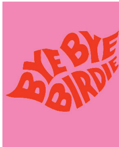
Bye Bye Birdie October 12-29 2017