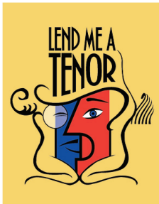
Lend Me A Tenor March 1-18 2018