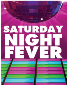
Saturday Night Fever July 6-23 2017