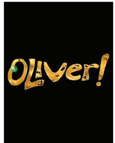
Oliver! The Musical April 12-29 2018

Ask about Dinner & Show Packages to enjoy a full evening out by combining the show with dinner at many of the fine restaurants within walking distance of the Lake Worth Playhouse.