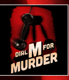
DIAL "M" FOR MURDER MARCH 3 - 12, 2023