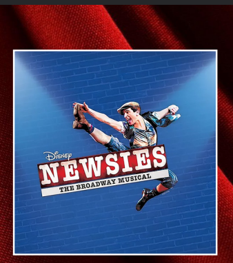
NEWSIES THE BROADWAY MUSICAL APRIL 14 - 30, 2023

713 Lake Avenue Lake Worth Beach, FL. 33460 Box Office: 561.586.6410 www.lakeworthplayhouse.org