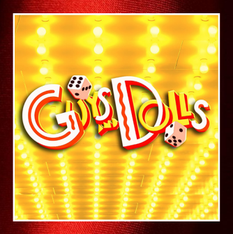
GUYS AND DOLLS JANUARY 20 -FEBRUARY 5, 2023