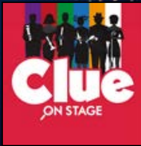
CLUE MARCH 1 - 10, 2024