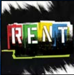
RENT OCTOBER 6 - 22, 2023