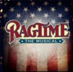
RAGTIME APRIL 5 - 21, 2024

713 Lake Avenue Lake Worth Beach, FL. 33460 Box Office: 561.586.6410 www.lakeworthplayhouse.org