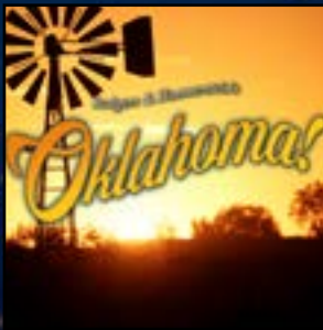
RODGERS AND HAMMERSTEIN'S OKLAHOMA! JAN 19 - FEB 4, 2024