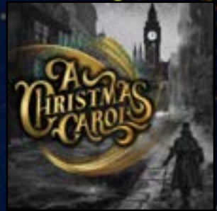
A CHRISTMAS CAROL NOV 17 - DEC 3, 2023