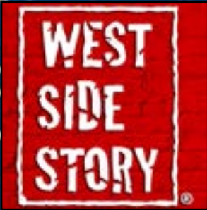
WEST SIDE STORY JULY 14 - 30, 2023